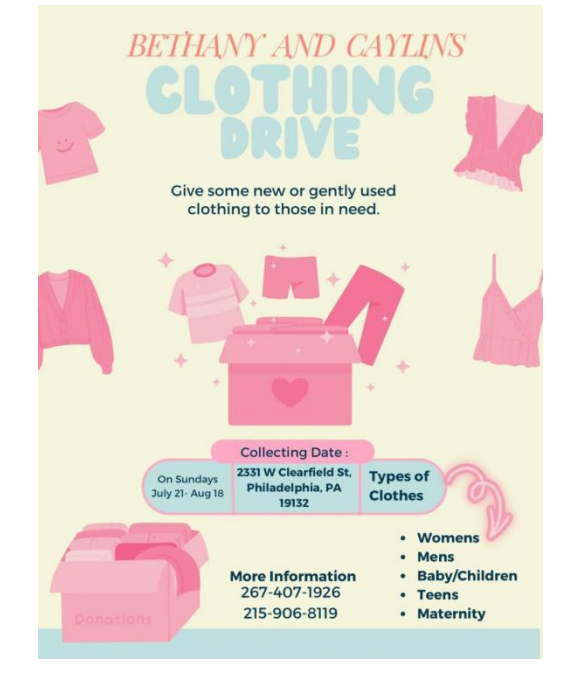
July 21, 2024 thru August 18, 2024