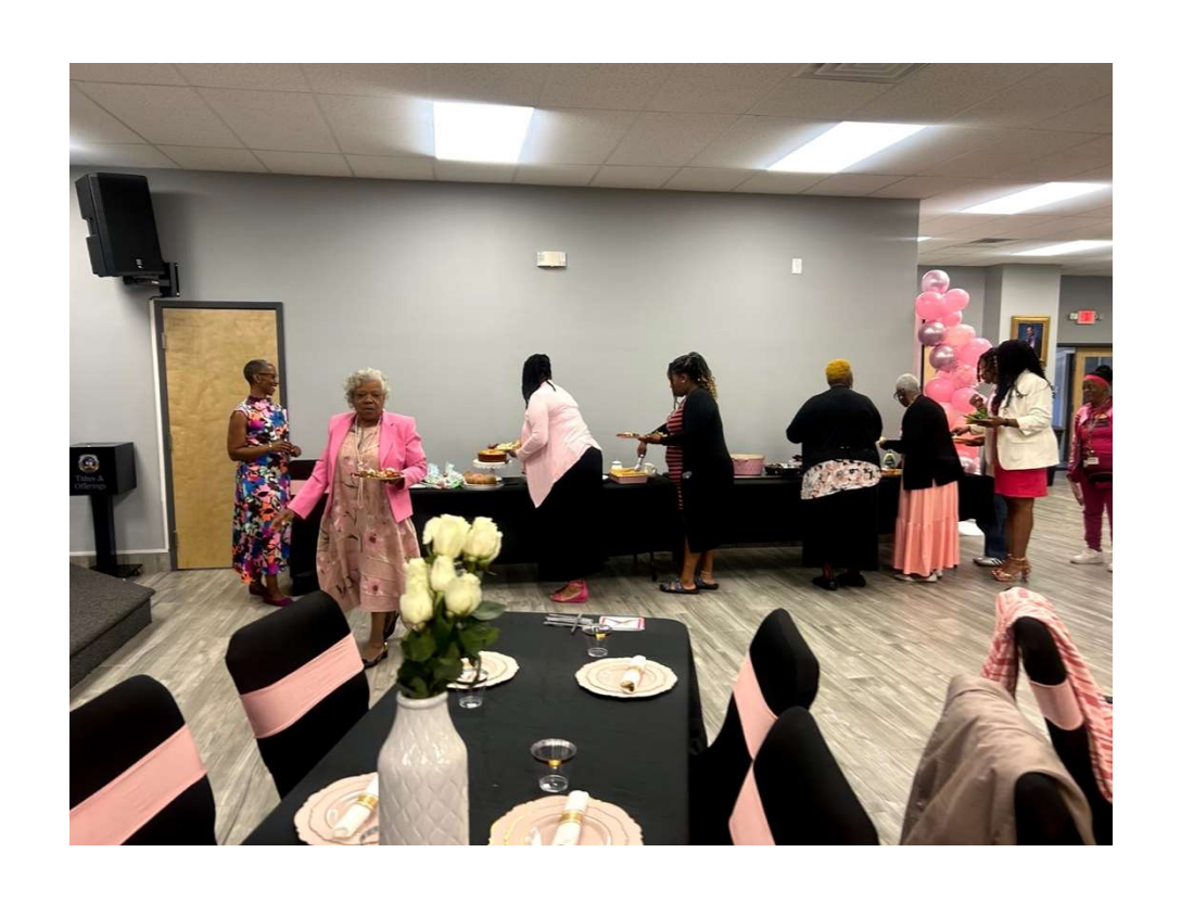
More photos of the serving line at brunch