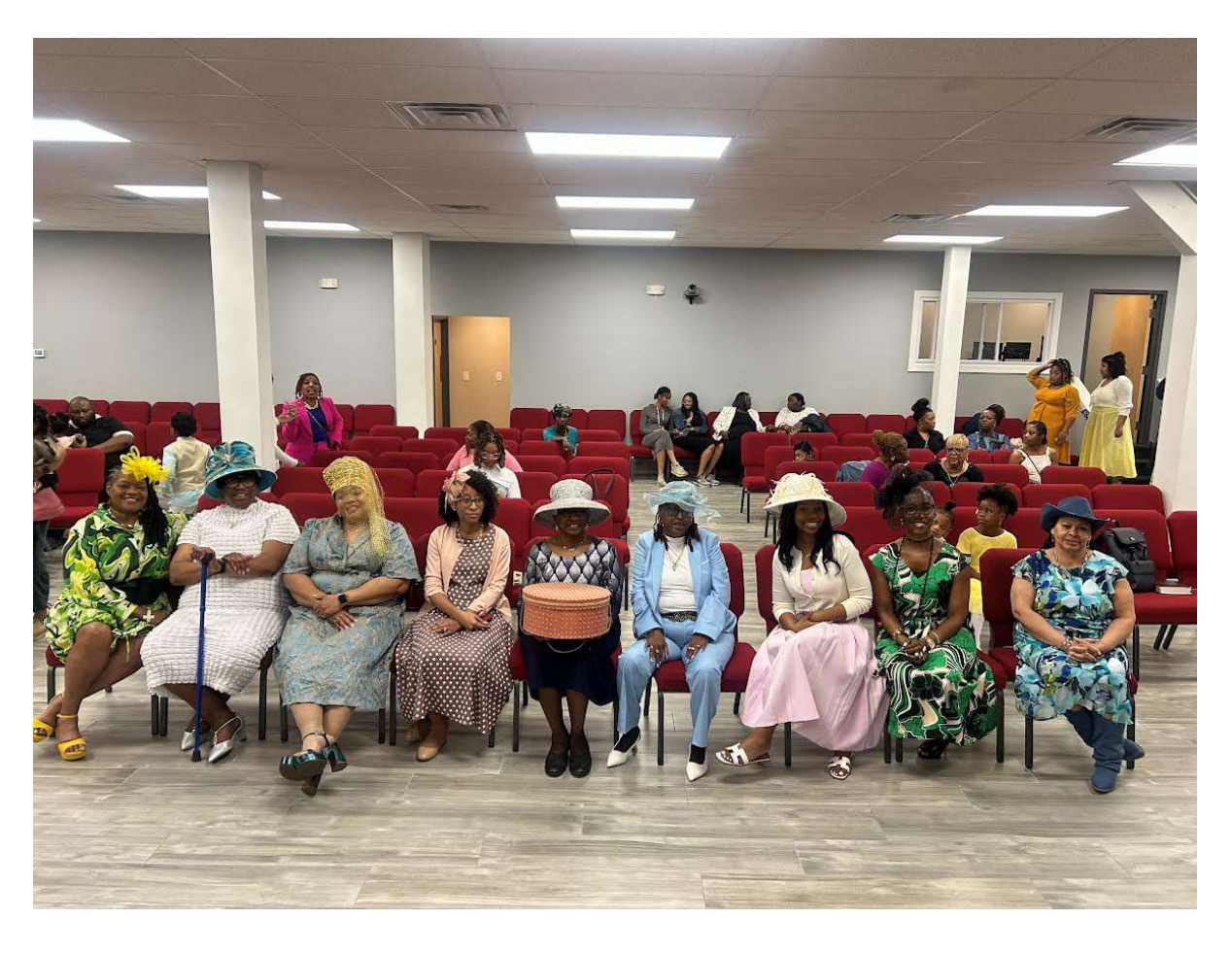
CFEC Ladies wearing their beautiful hats during the contest.