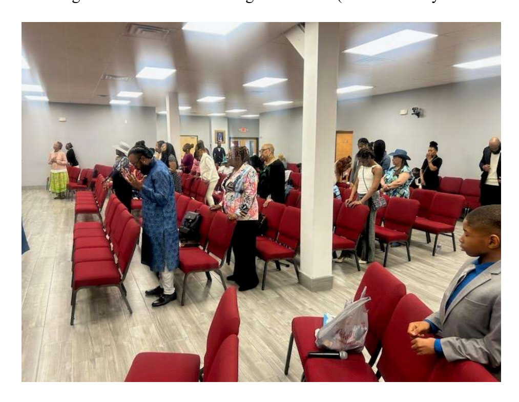
CFEC Congregation worshiping in the sanctuary.